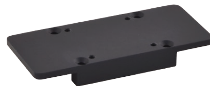
AP-CC-01 Conduction-Cool Kit