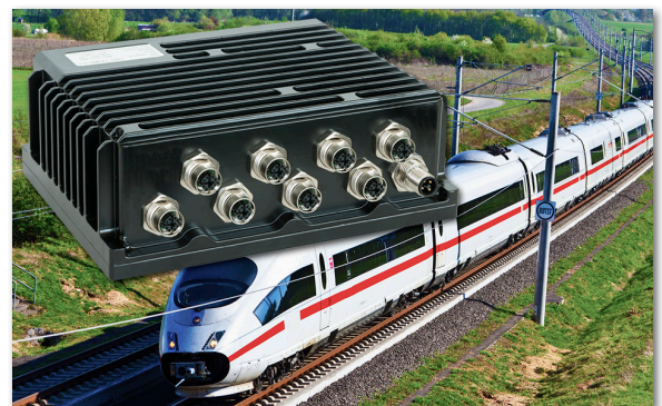
8-port MPL Switch with 8 x M12 connectors and power for use in Railway applications