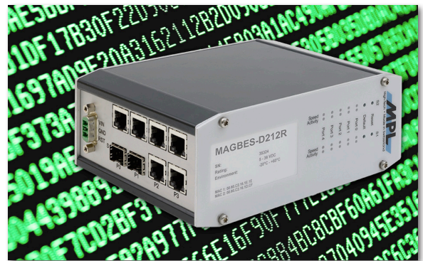
Boxed 8-port MPL Switch with 6 copper ports on RJ45 and 2 fiber ports on SFP

* Typically 10 years or more, 20+ years repair-ability